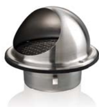
Stainless steel outer hood MVM 122 bVs N