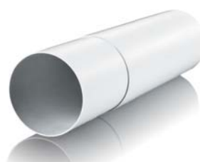
Round 125 mm telescopic air duct, Adjustable length 500 up to 1000 mm